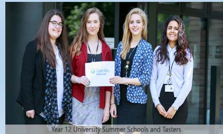
Year 12 University Summer Schools and Tasters